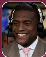
Kevin Weekes Former NHL Goalie Broadcaster/Analyst for NHL & ESPN COMMUNITY VISION AWARD